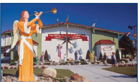
Heralding Angels welcome you to Bronner's (West Entrance shown)